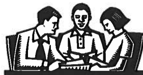
BIBLE STUDIES/PRAYER & SHARE